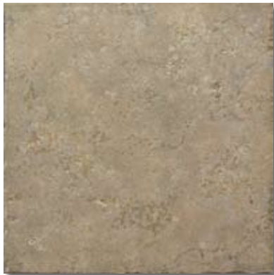
BURMESE MGPE6BU (6" x 6") MGPE6BUDBN (DBN) | MGPE6BUSBN (SBN)