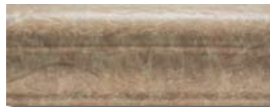
QUEEN V-Cap MGPE6QUVC (2" x 6")