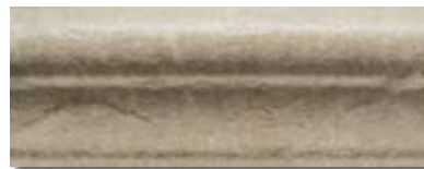
BURMESE V-Cap MGPE6BUVC (2" x 6")