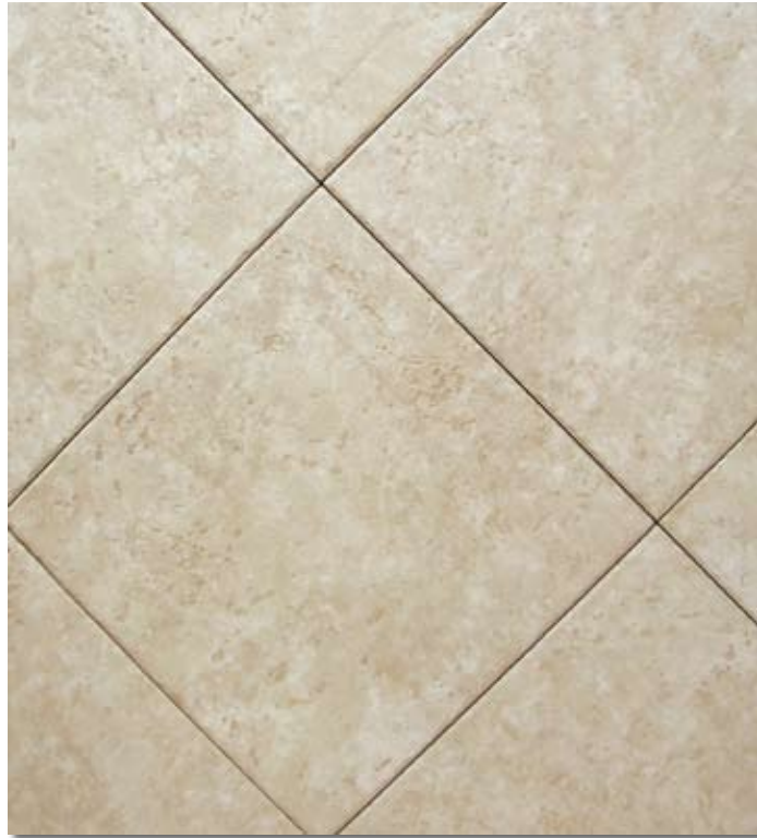
AKOYA MGPE6AK (6" x 6") | MGPE12AK (12" x 12") | MGPE18AK (18" x 18")