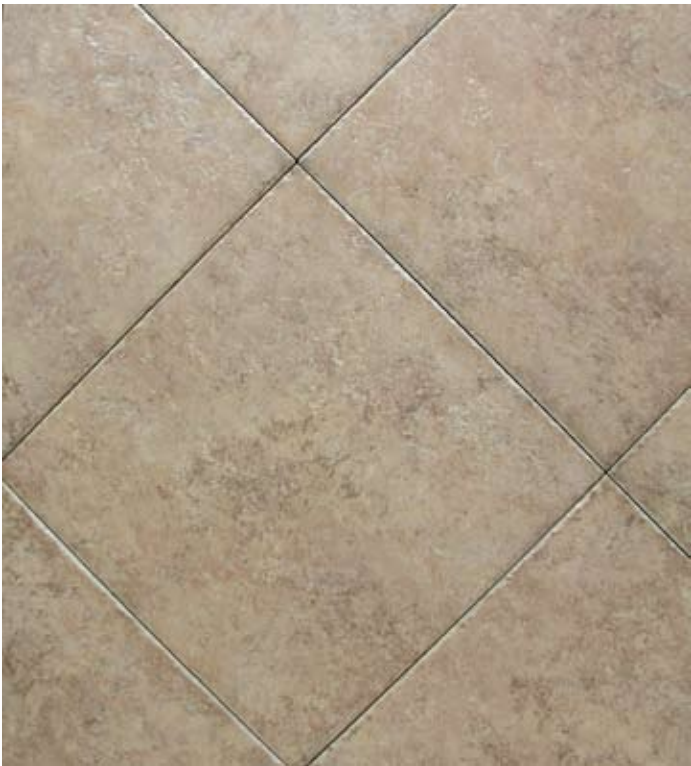
BURMESE MGPE6BU (6" x 6") | MGPE12BU (12" x 12") | MGPE18BU (18" x 18")