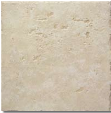
AKOYA MGPE6AK (6" x 6") MGPE6AKDBN (DBN) | MGPE6AKSBN (SBN)