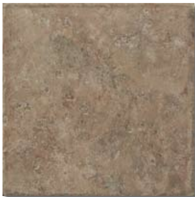
QUEEN MGPE6QU (6" x 6") MGPE6QUDBN (DBN) | MGPE6QUSBN (SBN)