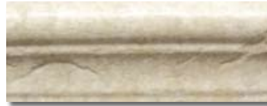
AKOYA V-Cap MGPE6AKVC (2" x 6")