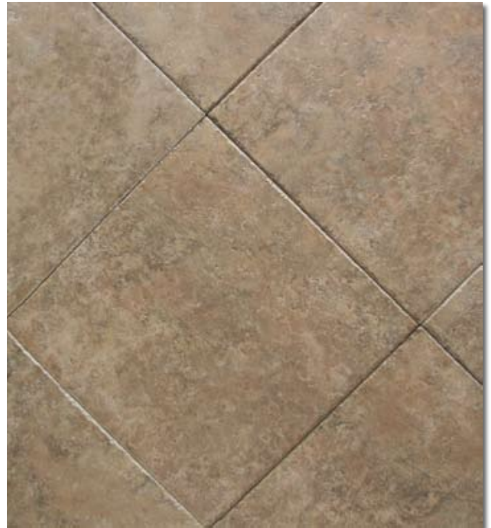
QUEEN MGPE6QU (6" x 6") | MGPE12QU (12" x 12") | MGPE18QU (18" x 18")