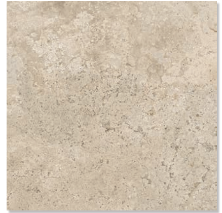
Color: "CARAMEL" matte Size: 40" x 40" rectified Item #: EPBACA39