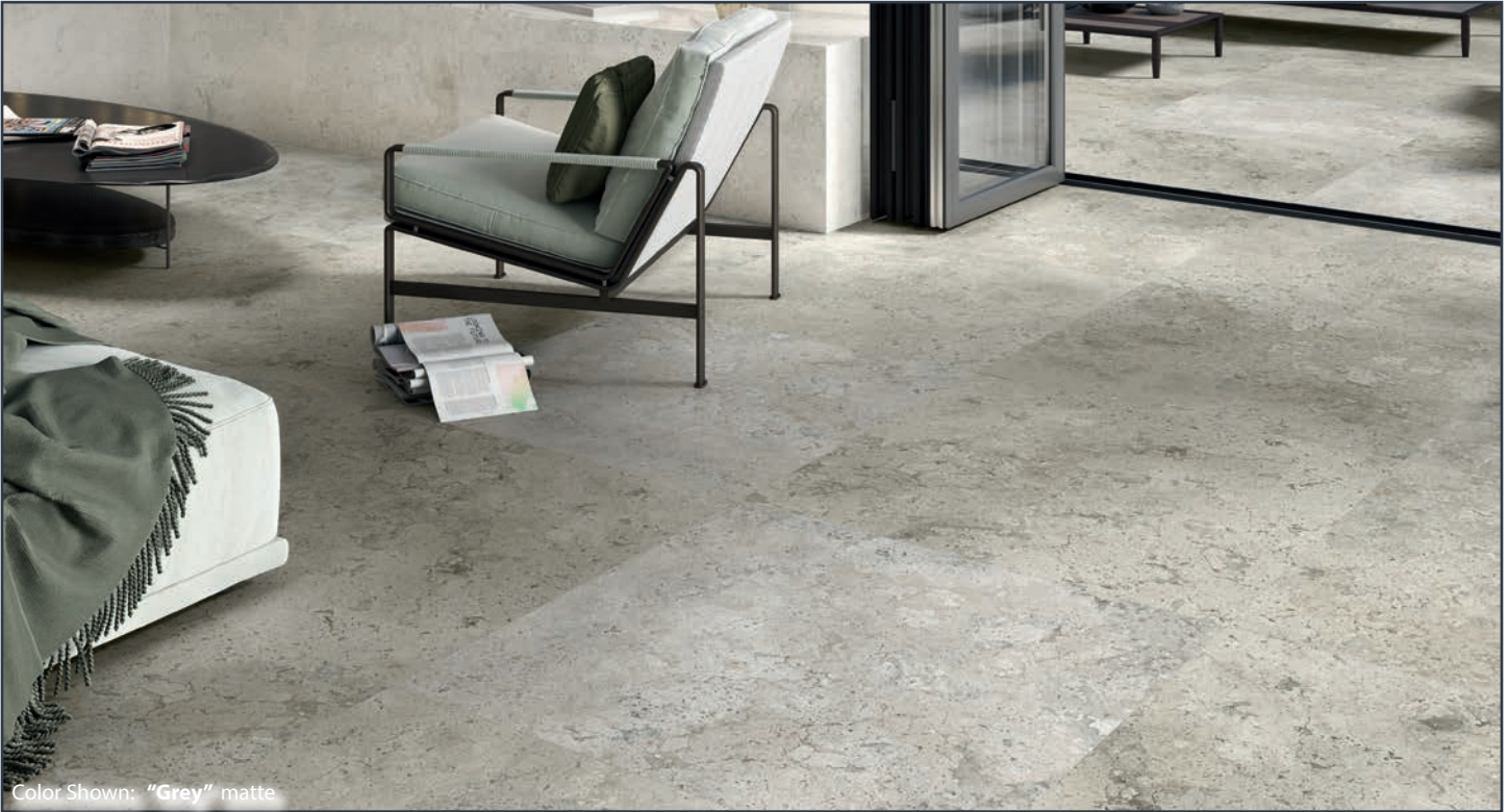
Color Shown: "Grey" matte