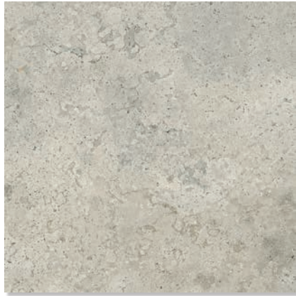
Color: "GREY" matte Size: 40" x 40" rectified Item #: EPBAGR39