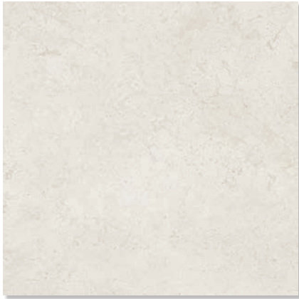
Color: "WHITE" matte Size: 40" x 40" rectified Item #: EPBAWH39